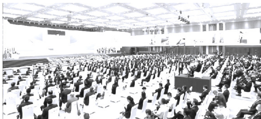
(From page 1)

Further, he underscored the importance of building dynamic industry ecosystems as a foundation for “generating quality jobs, creating new products and services, improving environmental sustainability, and ensuring shared prosperity for all.” Encouraging the CAEXPO attendees to visit the Philippine pavilion, the president also promoted